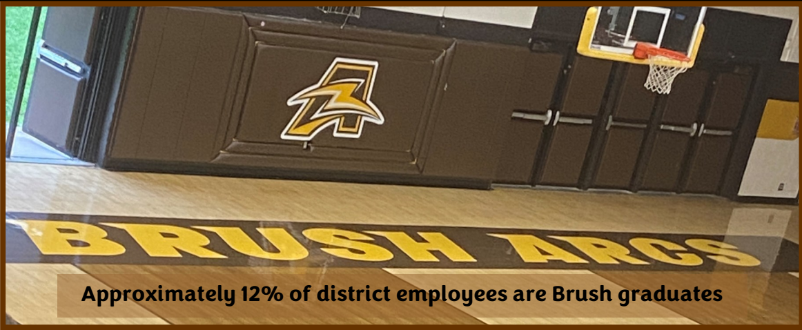
Approximately 12% of district employees are Brush graduates