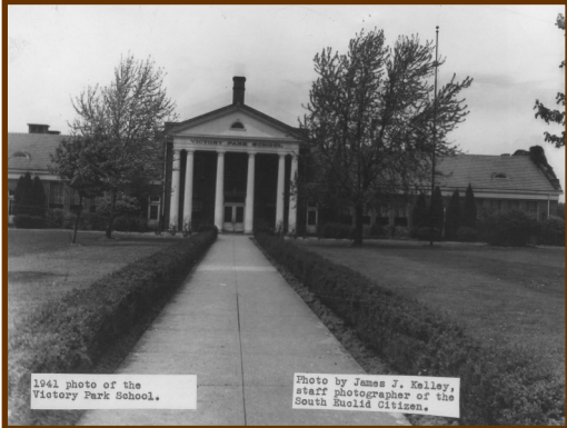
1941 photo of the Victory Park School.