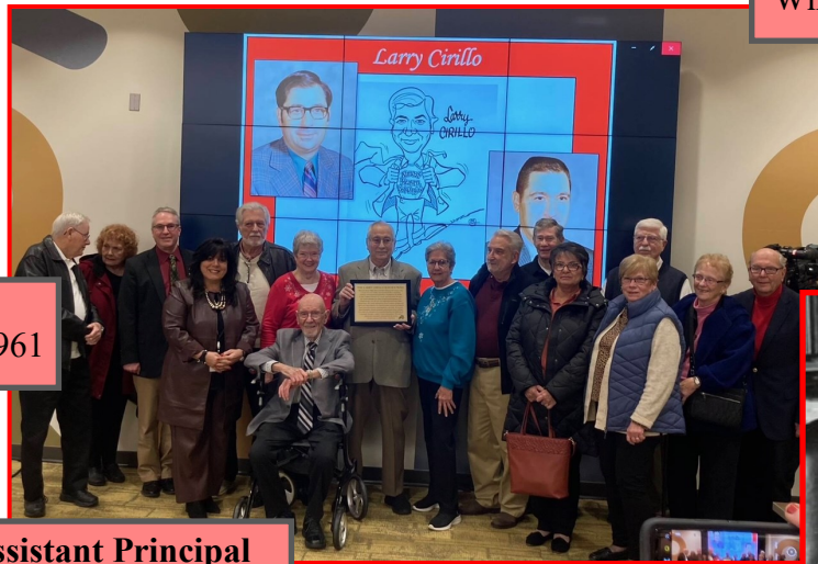
Assistant Principal Fall 1966—Spring 1985