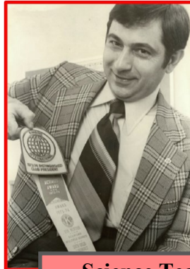
Science Teacher Fall 1956—Winter 1961